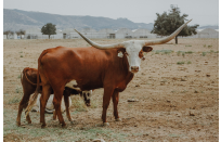
BAR H PALE FACE