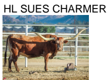
HL SUES CHARMER