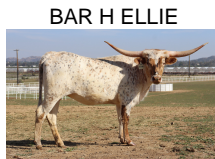
BAR H ELLIE