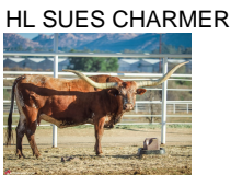
HL SUES CHARMER