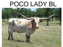
POCO LADY BL