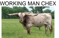
WORKING MAN CHEX