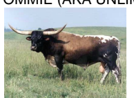
VJ TOMMIE (AKA UNLIMITED)