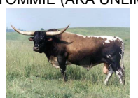
VJ TOMMIE (AKA UNLIMITED)