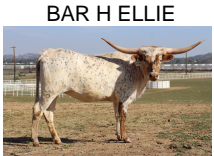
BAR H ELLIE